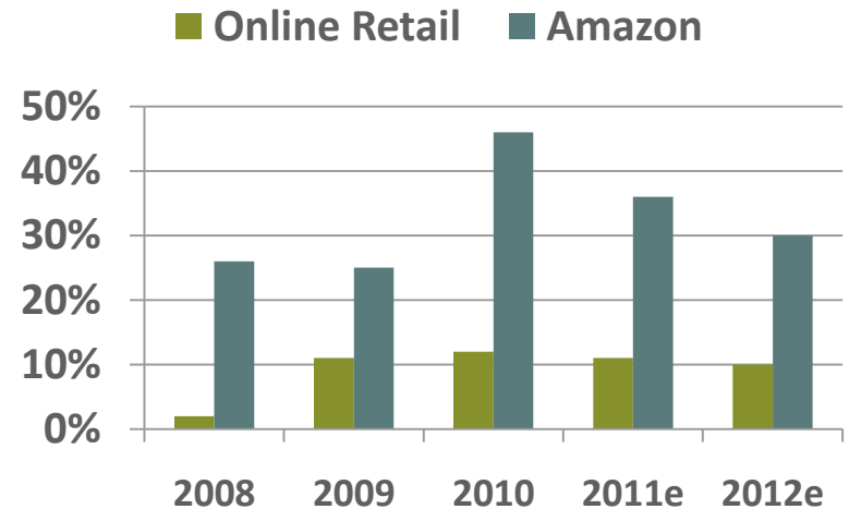
3 rd party sales 32% of total, growing faster than retail